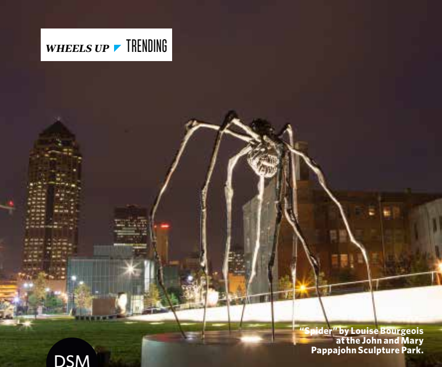
"Spider" by Louise Bourgeois at the John and Mary Pappajohn Sculpture Park.